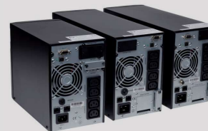
LBT models with customizable autonomy

These specifications may change without notice